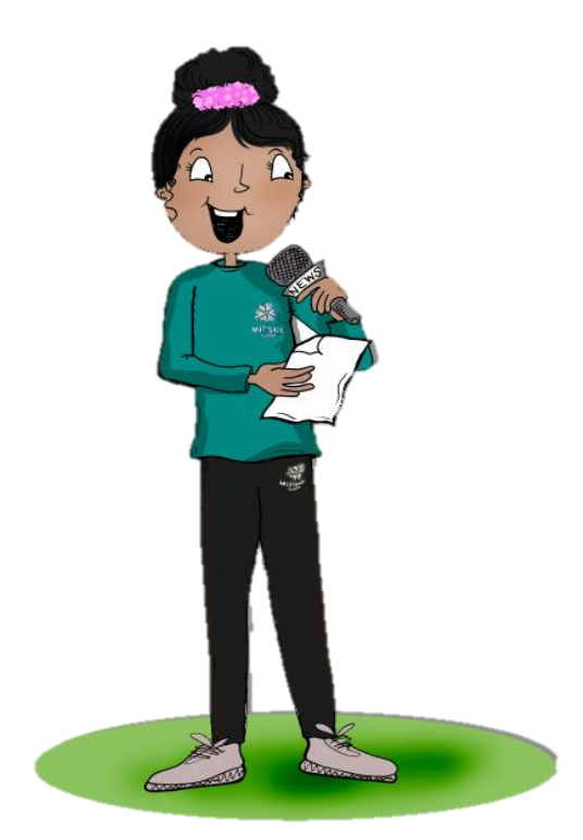
Transforming Lives and Inspiring Futures