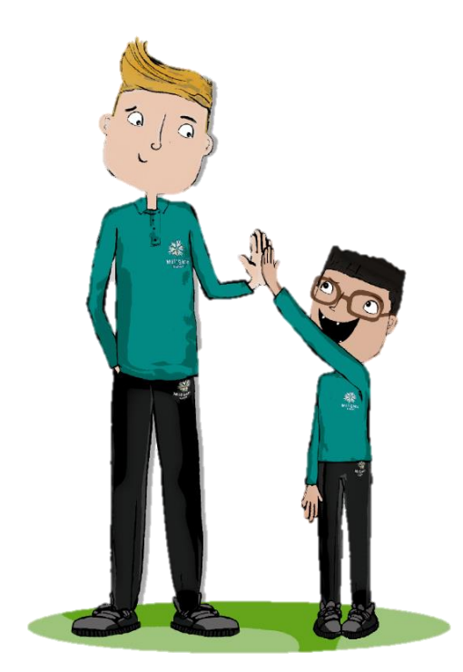
Transforming Lives and Inspiring Futures